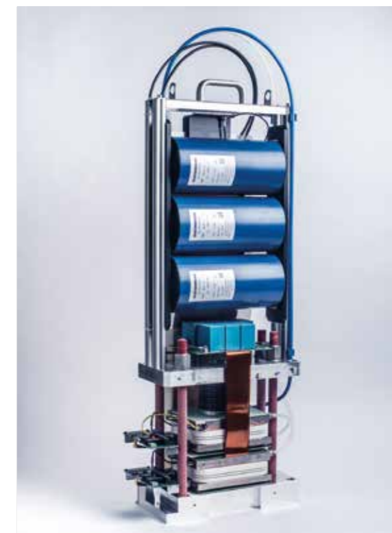
Pulse Power Module with Press Pack IGBT's

An optional bouncer circuit can be used for pulse lengths higher than 10 \mu s. The pulse length and repetition rate is continuously adjustable on the local control system or via an external interface. The ramping up and down time remains stable even when pulse width and repetition rate are changed. The regulated DC power supply on the input stage provides major advantages. It secures a low mains fluctuation even for applications with high pulse peak energies. The low output voltage ripple and pulse to pulse accuracy of less than <20 ppm (rms) is outstanding. These power supplies and control system are built into standard 19 inch rack chassis and are highly modular. The mechanical layout can easily be customized and the size can be kept to an absolute minimum, depending on the required average system power.