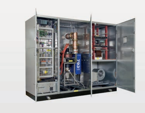
Rear view of RF amplifier with IOT.

The 3 GLS facility Shanghai Synchrotron Radiation Facility (SSRF) is the biggest scientific platform and research facility and technology development in China. The energy of the storage ring is one of the highest values for medium-energy light sources. Its performance is optimized in the widely used X-ray energy region. Designed to have a scientific lifetime of more than 30 years, the facility intends to provide